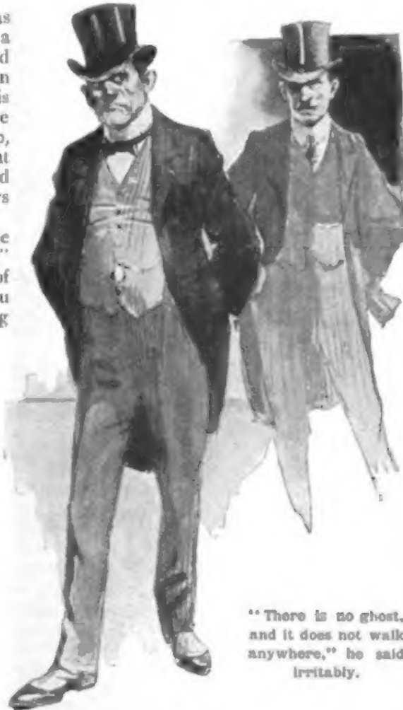
"There is no ghost, and it does not walk anywhere," he said irritably.

I thought there was something in what he said, and did not press him further.